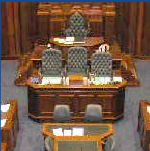
Speaker's location in the Legislative Assembly Chamber

The role of the Speaker is an ancient and important office of the Westminster parliamentary system. The first person to be called the Speaker of the House of Commons was appointed in 1377. The name Speaker dates from a time when the House of Commons 1 was only allowed to address humble petitions to the Crown through its appointed spokesman, the Speaker. The procedure of the House of Commons revolved around talking until the opinion of the majority was discovered. Once the majority opinion was agreed on, the Speaker was sent to express it to the Crown. At least nine British Speakers are known to have died a violent death because the monarch did not want to hear what the Speaker had to say or agents of disgruntled barons and lords carried out similar persecution. The position of Sergeant-at-Arms was created in order to protect the Speaker from harm.