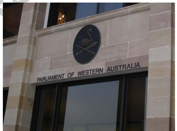
Front entrance of Parliament House