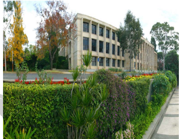
South-east corner of Parliament House

important ways to examine the government's administration;