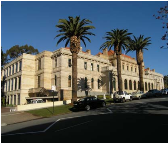
North-west corner of Parliament House

Broadly, the Parliament debates public policy and passes laws (including those to appropriate money), provides and checks the government, and represents the people.