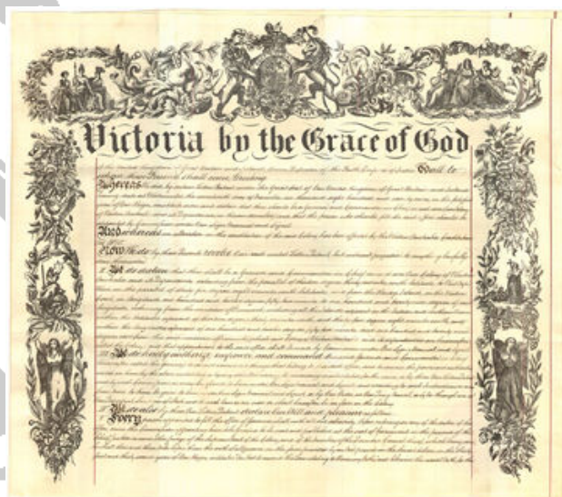
Letters Patent re Constitution, 25 August 1890