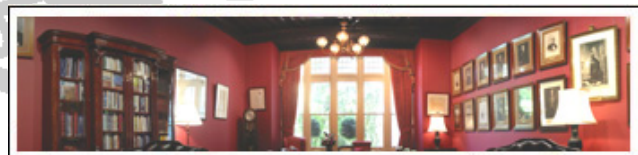
Executive Council Room

The Executive Council is the supreme executive authority in Western Australia and is chaired by the Governor; it includes at least two members of the Ministry and has as its secretary the Director General of the Department of the Premier and Cabinet. It meets fortnightly and for special occasions requested by the Premier.