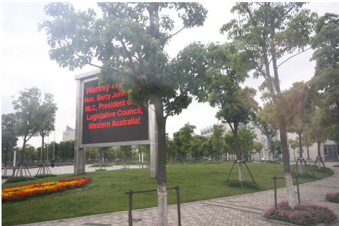
Picture: The welcoming note at the Shanghai Maritime University for the President.

The amount of resources being devoted to road, rail, port, airport and urban renewal infrastructure in designated economic zones of South East China is staggering. Large amounts of China's stimulus money, as a result of the global financial crisis have been dedicated to these nation building projects and the scale and speed of development is astounding.