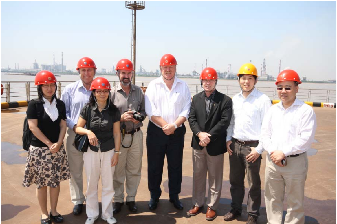
Picture: The delegation visiting the Dalian deep water port, which has enormous capacity for very large cargo ships and accommodating facilities.