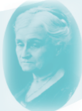
Edith Dircksey Cowan