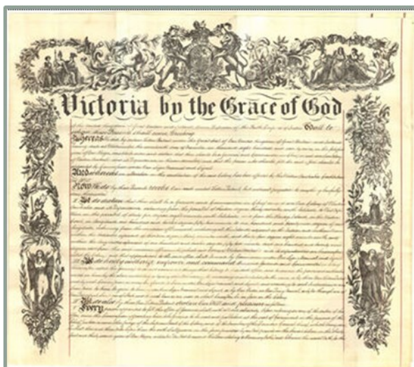
Letters patent re Constitution 25 August 1890 (UK)

The Letters patent have important provisions on the governor's role which were not included in the Constitution of Western Australia.