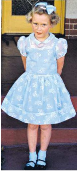
'Destined for great things'