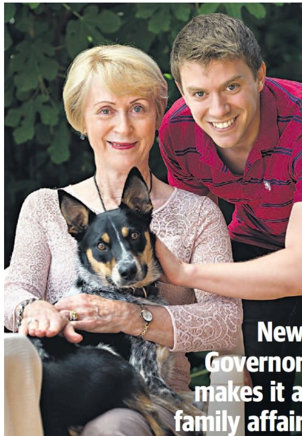
'New Governor makes it a family affair'