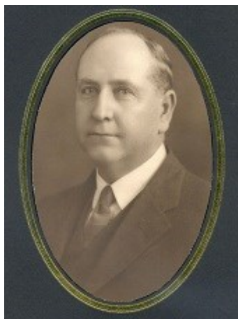
Hon Philip Collier