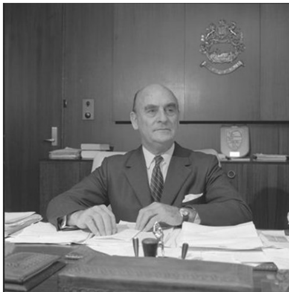
Premier John Tonkin

his early 20s, Tonkin joined the Australian Labor Party and remained a member for 70 years. In 1927 and 1930 he contested the WA seats of Sussex and Murray-Wellington before winning North-East Fremantle in 1933. In 1950 the seat was abolished and he then won the seat of Melville. In 1944 he was appointed Minister for Education and Social Services. By 1955 he was the Deputy Premier and from 1971 to 1974 he was Premier of Western Australia. The Tonkin government established Australia's first parliamentary ombudsman and an environmental watchdog and passed the state's inaugural Aboriginal heritage legislation. Tonkin was defeated in the 1973 election and retired two years later. He died in Perth aged 93 years. A state funeral service was held at Wesley Church in Perth.