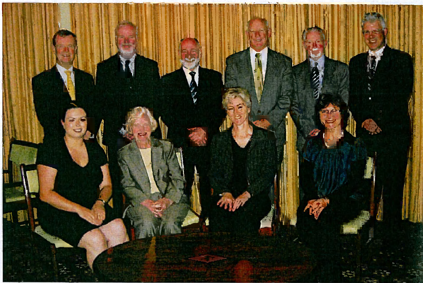
Dental Board of Western Australia - Board Members and Staff, October 2009.