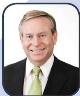
Hon Colin Barnett MEd MLA Premier; Minister for State Development

The Western Australian Government acknowledges that the local market to supply goods and services to major resource projects has become more competitive and complex. In November 2010, a review of the operation of the State Government's existing policy was announced. Since then, the Government has been engaged in extensive consultation with stakeholders on the need for a new approach. This consultation has resulted in the development of a set of improvements designed to maintain the flow of benefits from mineral and energy projects to the Western Australian economy and community.