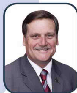
Hon Simon O'Brien MLC Minister for Finance; Commerce; Small Business

The Western Australian Government acknowledges that the local market to supply goods and services to major resource projects has become more competitive and complex. In November 2010, a review of the operation of the State Government's existing policy was announced. Since then, the Government has been engaged in extensive consultation with stakeholders on the need for a new approach. This consultation has resulted in the development of a set of improvements designed to maintain the flow of benefits from mineral and energy projects to the Western Australian economy and community.