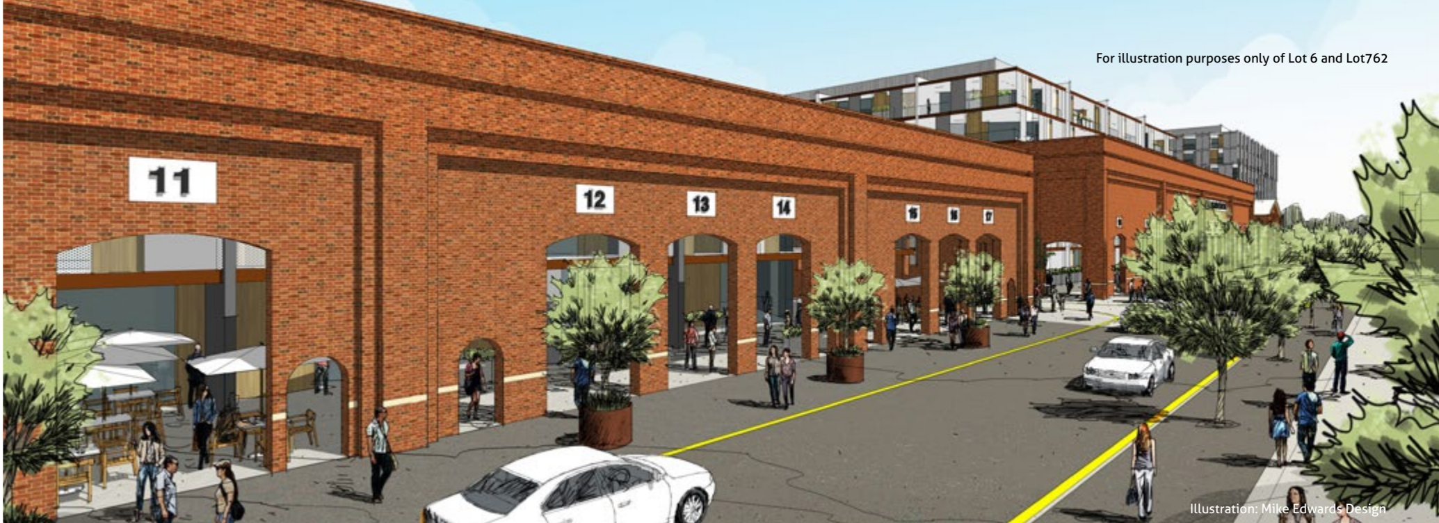
For illustration purposes only of Lot 6 and Lot 762

The Midland project is transforming the historic suburb through revitalisation works with more than $1.5 billion being invested by the State Government and the private sector. The Metropolitan Redevelopment Authority (MRA) has delivered new mixed-use developments incorporating residential, retail, office and community uses throughout the Midland city centre, along with award-winning residential estates and public spaces.