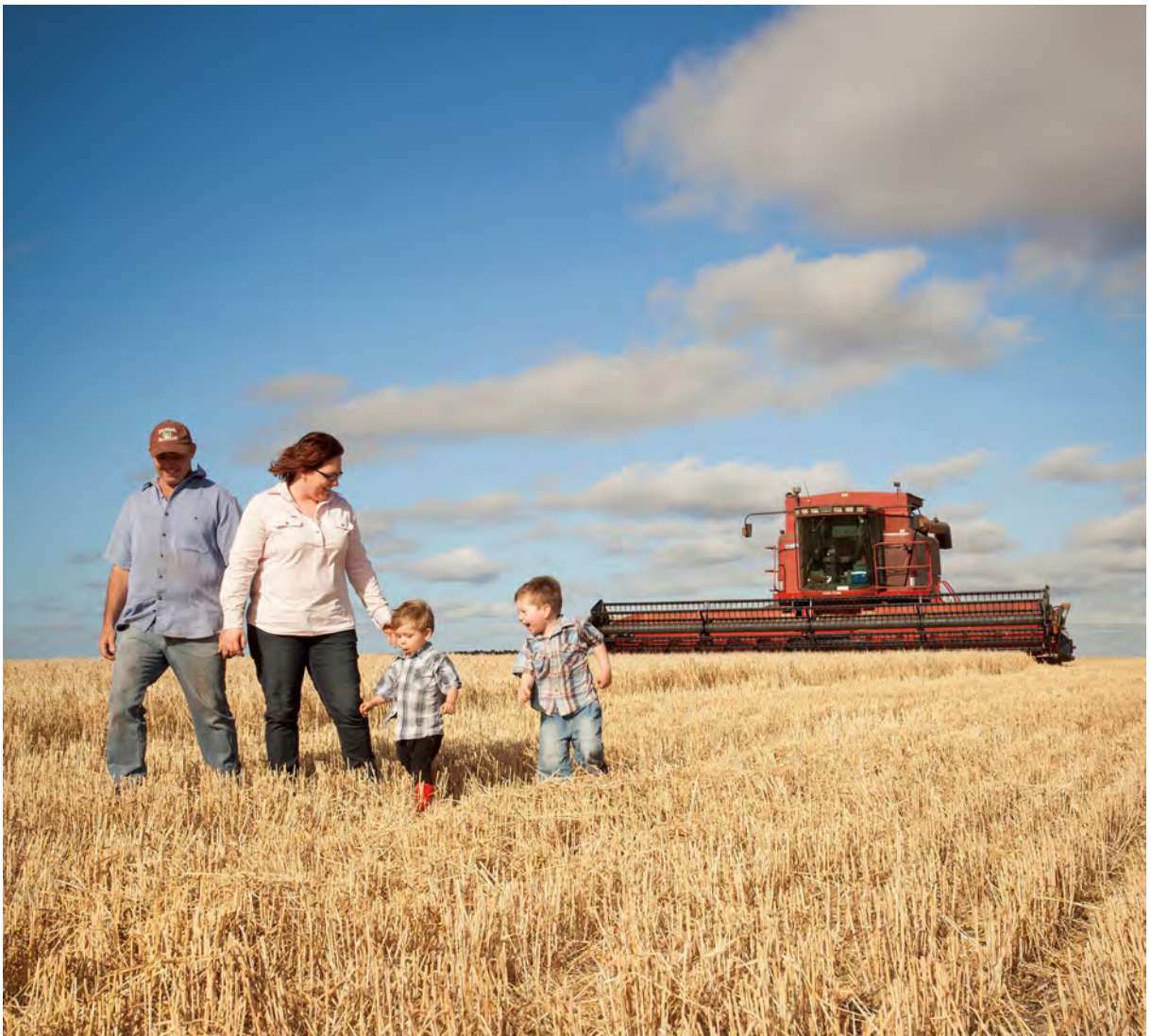
Image 1. The Burtons – building a biosecure future for their family.

However, the risks to our biosecurity system are increasing.