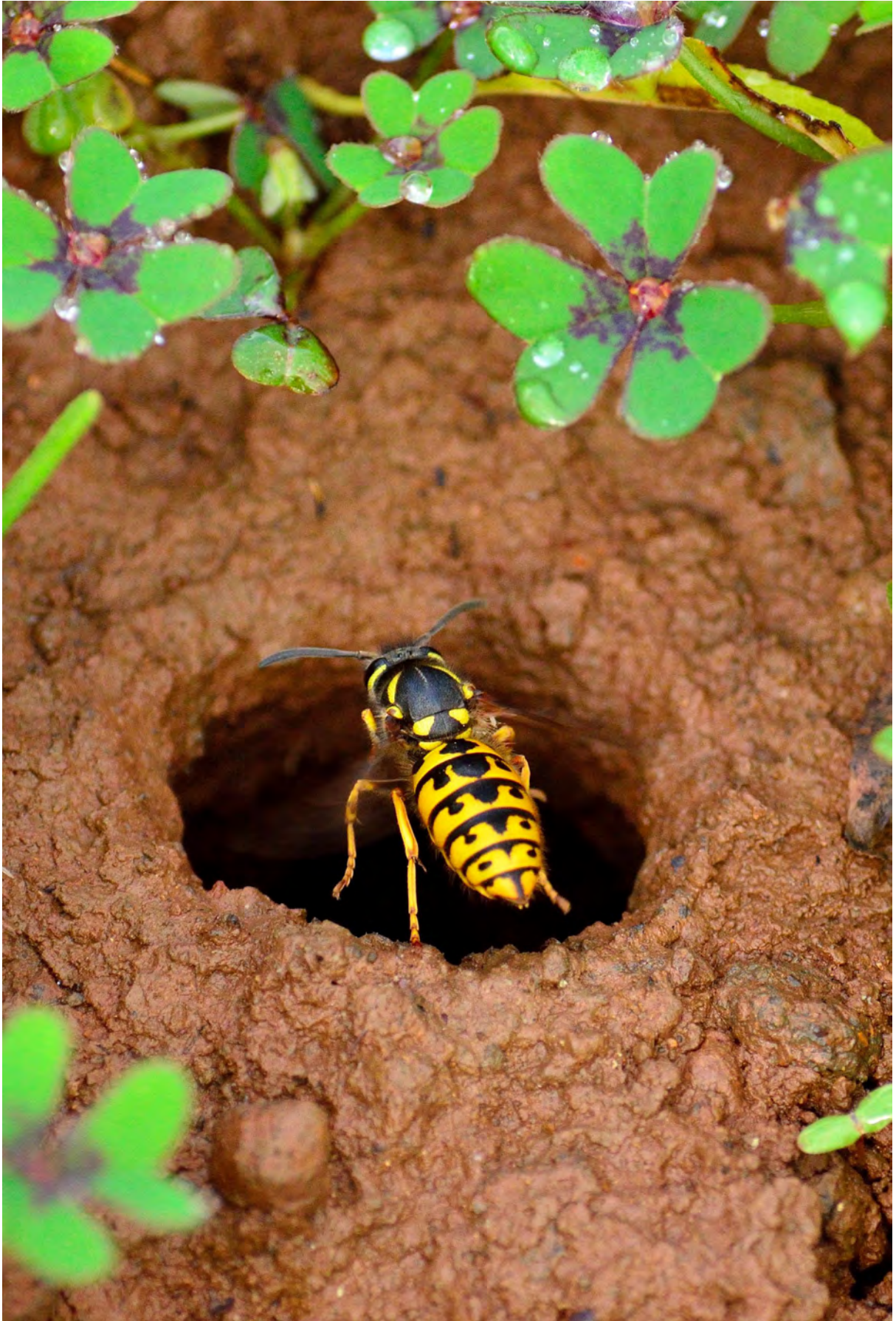
Image 5. European wasp at nest entrance. European wasps are considered one of the worst wasps in the world