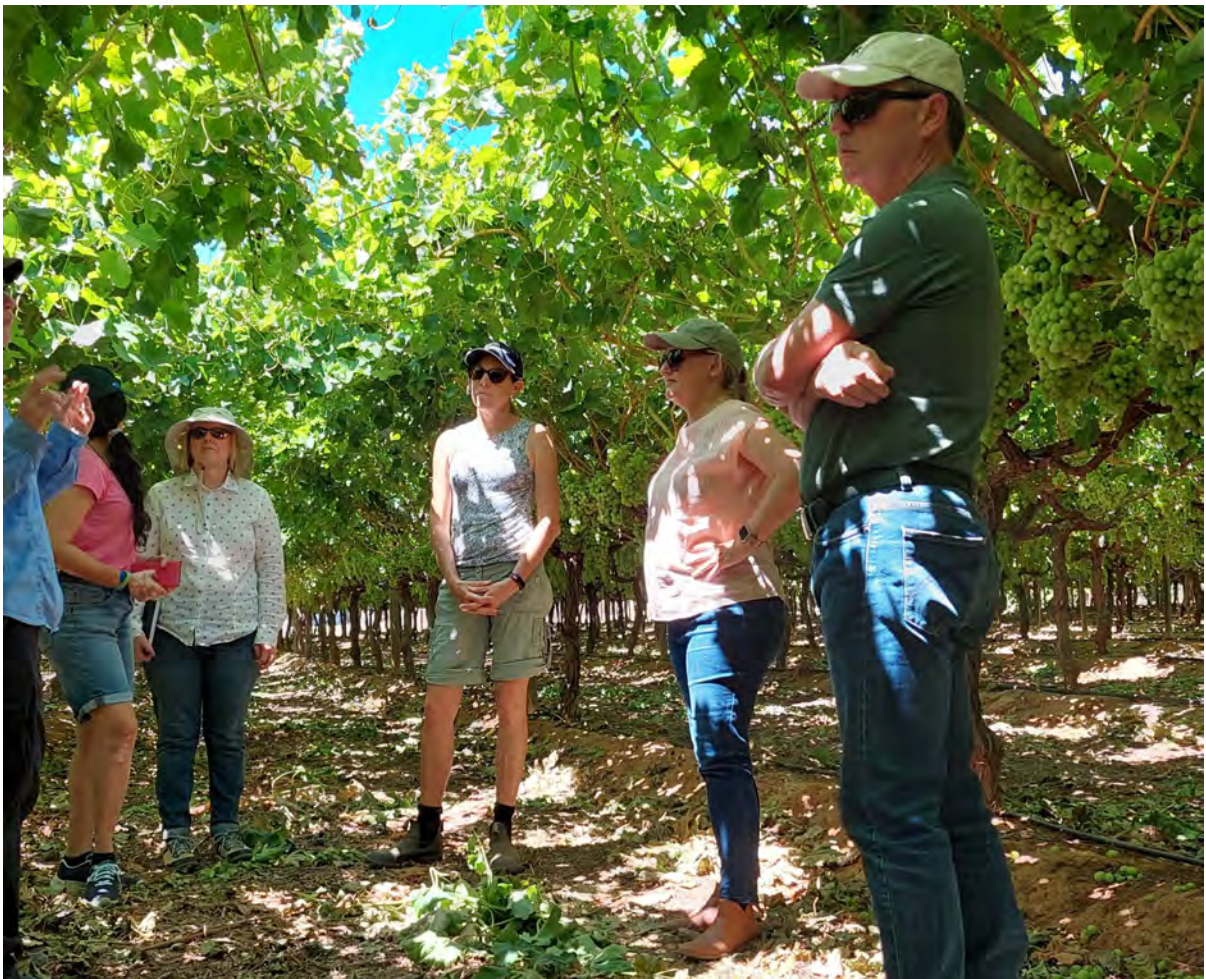
Image 3. Biosecurity Council members met with growers in Carnarvon

The issues raised with the Council during its time in Carnarvon were discussed with DPIRD and the Minister. Importantly, the visit helped Council better understand the needs and challenges of the industries and community of the region.