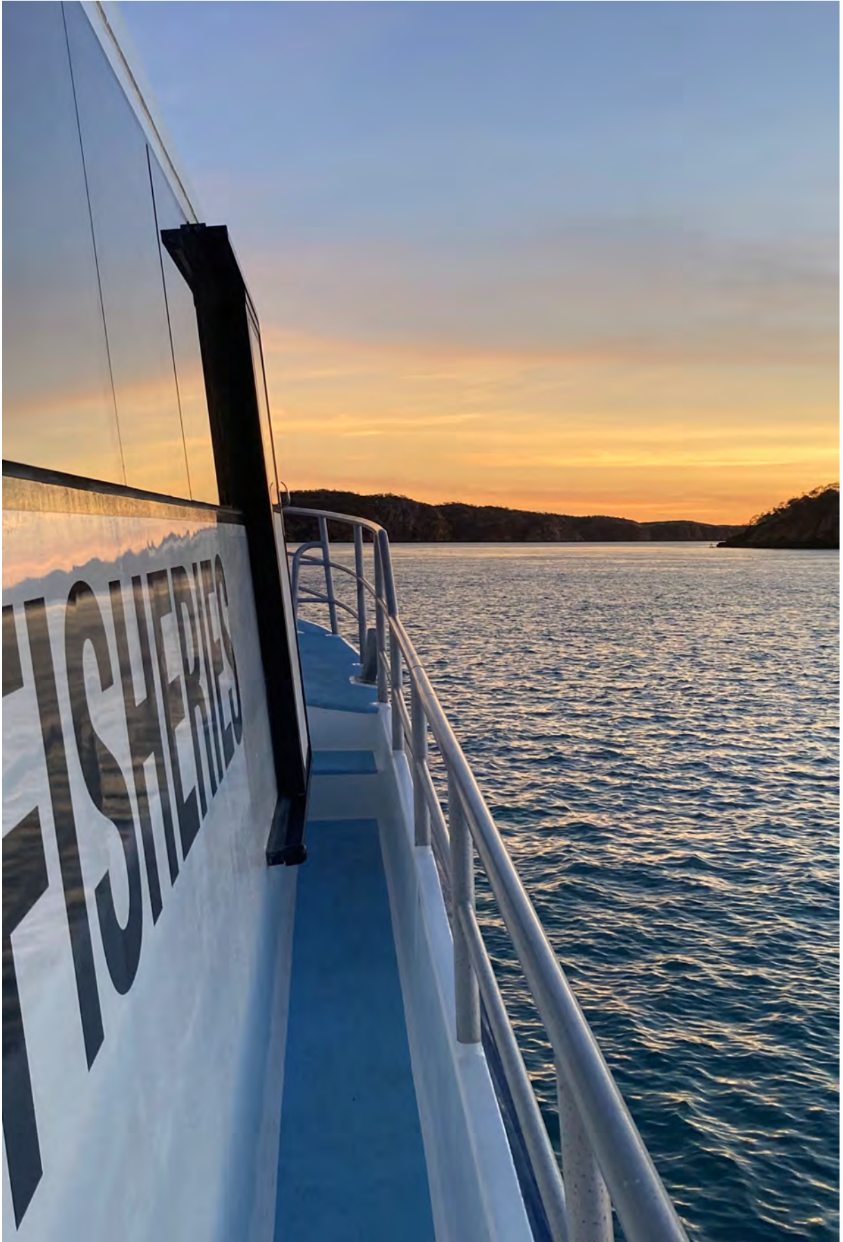
Image 2. Buccaneer Archipelago. Biosecurity is important to the health of WA's aquatic environments