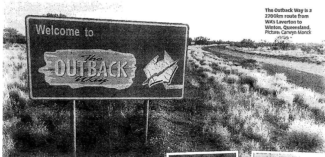
The Outback Way is a 2700km route from WA's Laverton to Winton, Queensland.

At a media conference outside his Kalgoorlie-Boulder electorate office on Tuesday morning, the Liberal's Federal Member for O'Connor Rick Wilson said the media report had given him "great concern". "If this funding is scuttled, then... (the) hope that those communities have finally received something to look for-