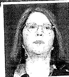
Catherine King