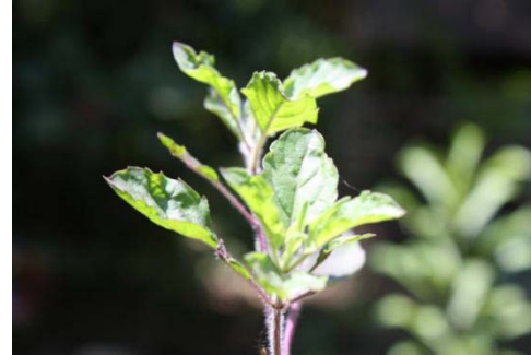
Tulsi ( Ocimum sanctum )

The following link provides a summary of few Australian traditional flora and fauna medicinal value.