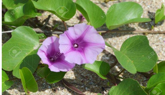
(Ipomoea pes-caprae) Goat' s Feet

about the Australian leadership and WA parliament. So far I am working on this project of my own for last two years but due to funding issues, its getting delayed. I will appreciate and willing to contribute in every possible way if opportunity open.