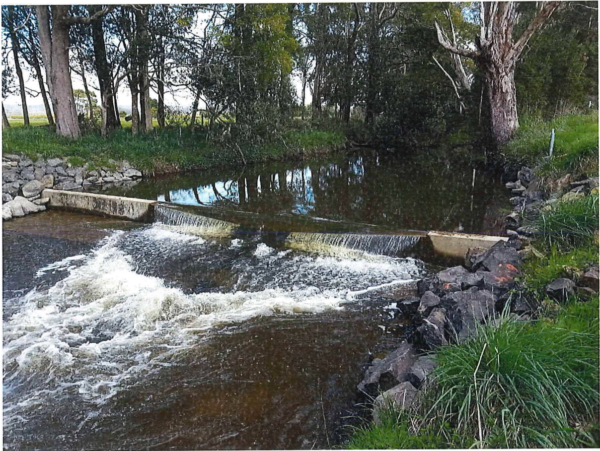
Figure 1 – Likely gauging structure across the Donnelly River