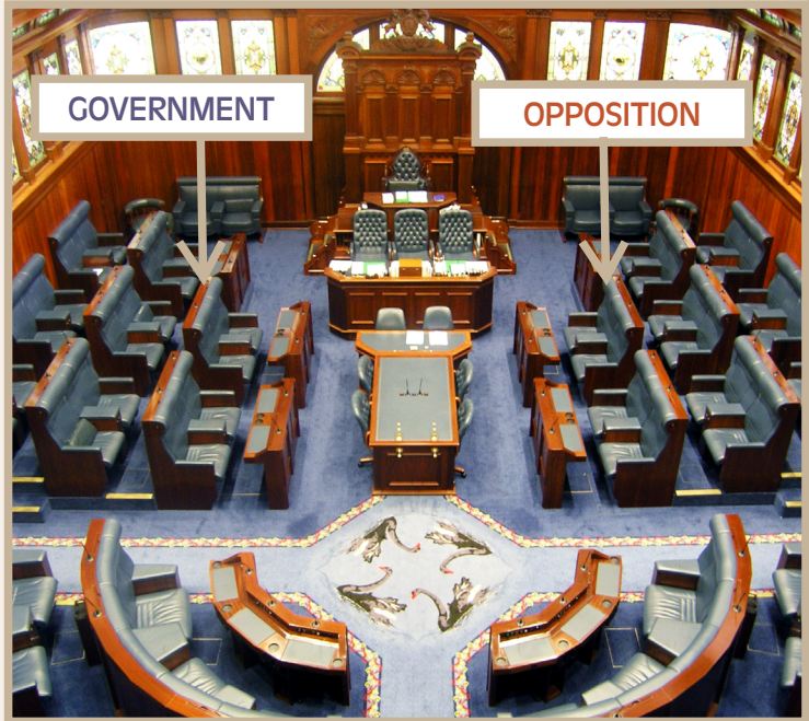
Government and opposition separation in the Legislative Assembly chamber

Opposition Leaders rely heavily on the procedures of each house to enhance their role. These procedures include Questions without Notice and Questions on Notice to ministers, budget debates, legislative debates, making speeches on motions (including Matters of Public Interest), and grievance and adjournment debates. Apart from the range of parliamentary procedures, the Leader of the Opposition and shadow ministers also promote their own policies to the public through the media. The Leader of the Opposition in Western Australia has always been a member of the Legislative Assembly (MLA). When the Assembly is in session, the Opposition Leader sits to the Speaker's left, directly opposite the Premier. The Speaker usually affords the Leader of the Opposition the right to ask the first Question without Notice. On other parliamentary procedures the Speaker usually recognises the call of the Leader of the Opposition. The Leader of the Opposition fulfils a vital function in our parliamentary system of government and, in collaboration with the other opposition members, contributes to the preservation of our democracy.