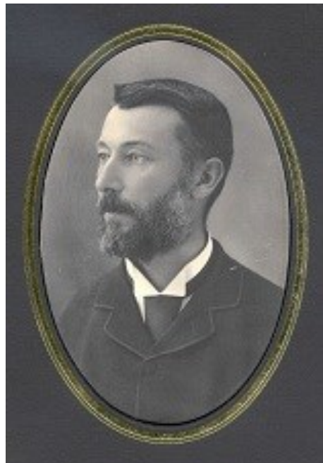
Hon John Winthrop Hackett MLC