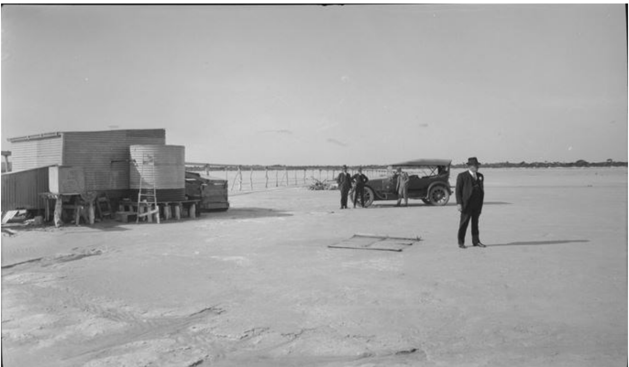
Premier Scaddan, foreground, on Pink Lake, 1915