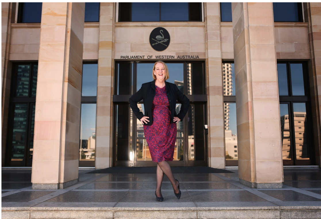
The Hon Michelle Roberts 'on the steps of Parliament House in West Perth', 21 March 2021

Michelle Roberts was councillor for the City of Perth from 1986 to 1993 and Deputy Mayor for the last two years of her service.