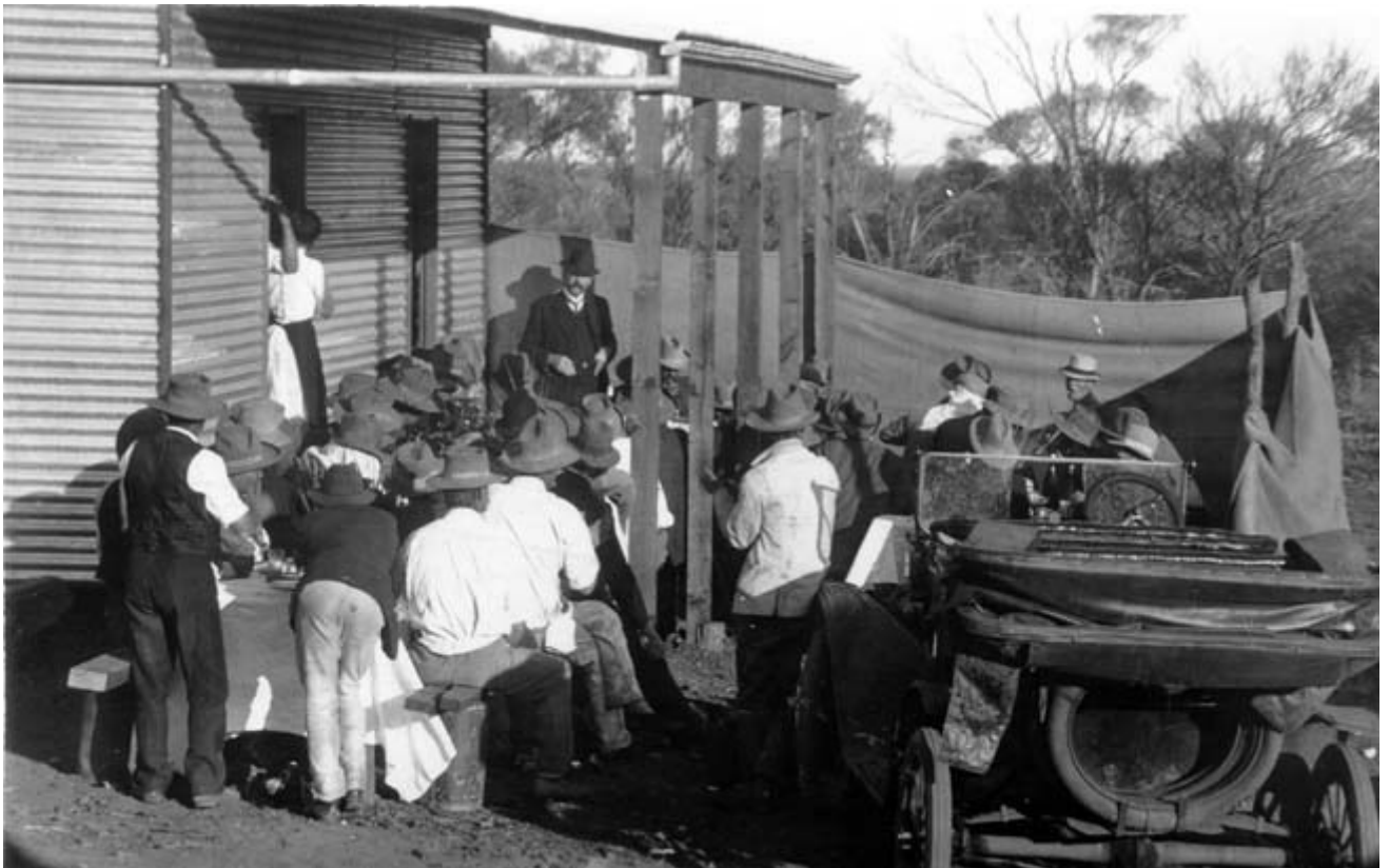
Philip Collier addresses a luncheon party of prospectors at Mt Keith

"I submit that the prosperity of any nation depends on the distribution of its wealth, not on the total production whatever", Hon Philip Collier's Inaugural Speech, 12 July 1906