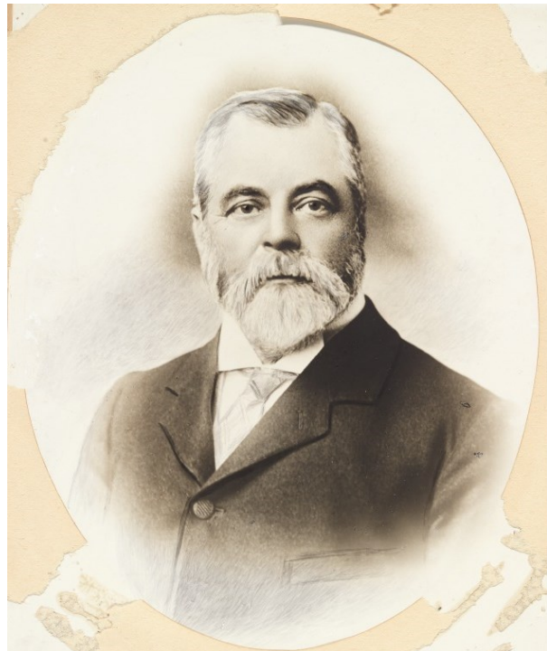
Sir George Shenton, ca. 1900