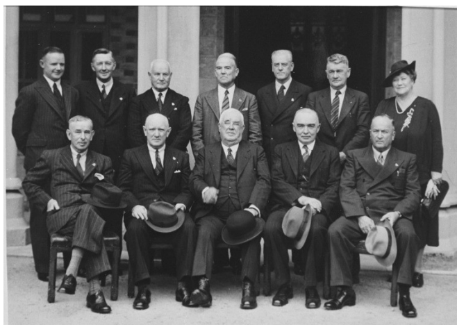
Premier Ross McLarty and his Cabinet (1947)

'We are proud of our democratic heritage which enables us to regard political opponents of whatever party...'