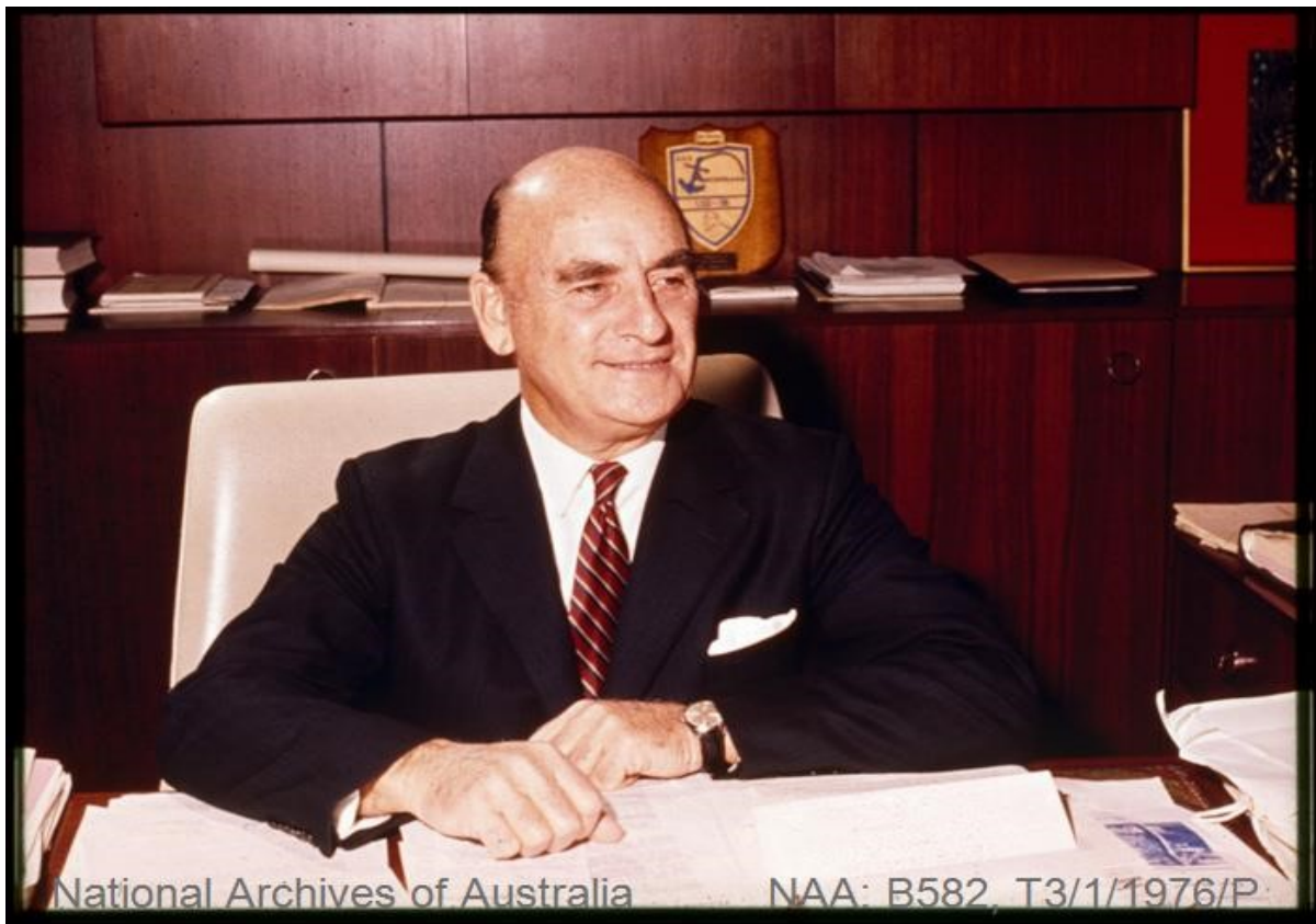
Photograph courtesy of National Archives of Australia NAA: B582, T3/1/1976/P