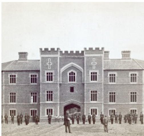
Soldiers in formation in front of Pensioner Barracks, Perth, c1863