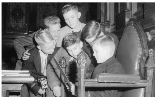
Chichester Boys' Club, Parliament House, 1959