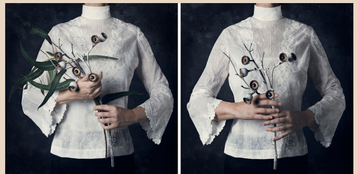
'Tough Nut to Crack' © Eva Fernández 2021

The images pay tribute to Edith Cowan's bravery and tenacity in becoming the first woman to enter the male-dominated domain — an achievement which Edith Cowan had described as a 'tough nut to crack'. The gumnut has subsequently become symbolic of Edith Cowan and reflected in Fernández's images of a young female figure holding gumnuts in a struggle to break them.