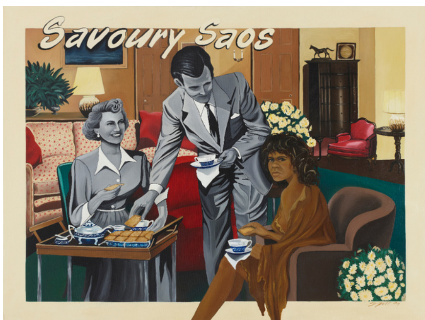
'Home-maker #1' (2009). Oil on canvas.